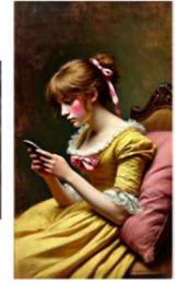
읽는 소녀 DALLE3