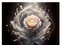
self-destructive innovation DALLE3